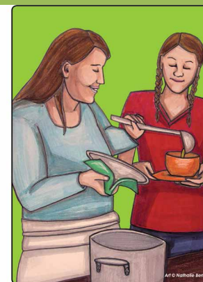
UNCRC Article 27

(Adapted from the publication Moving In Moving On Moving Out , created by Voices, Manitoba's Youth In Care Network www.voices.mb.ca )