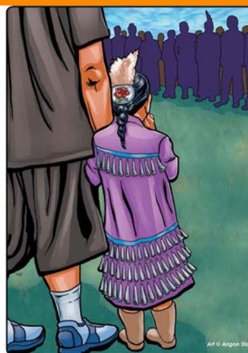
UNCRC Article 20

Every child deserves a champion -- an adult who will never give up on them, who understands the power of connection and insists that they become the best that they can possibly be. -- Rita F. Pierson